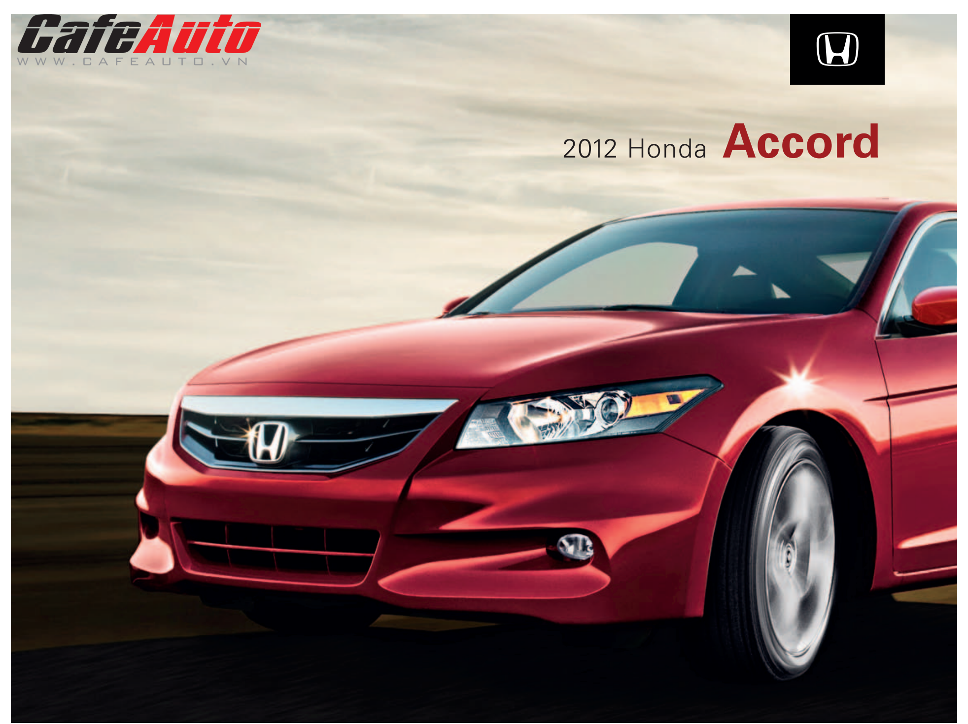
Tài liệu được lưu trữ tại http://cafeauto.vn