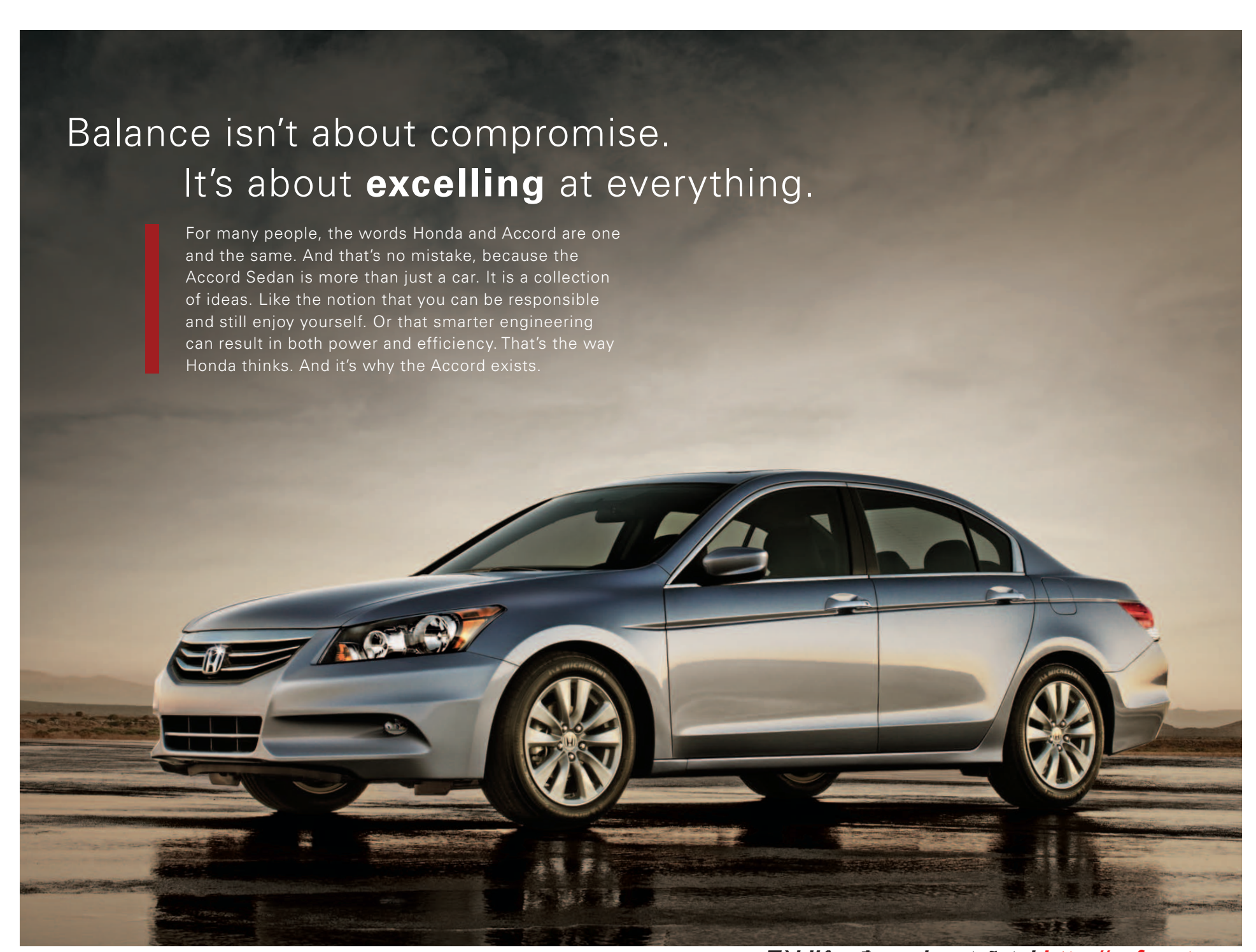
Tài liệu được lưu trữ tại http://cafeauto.vn